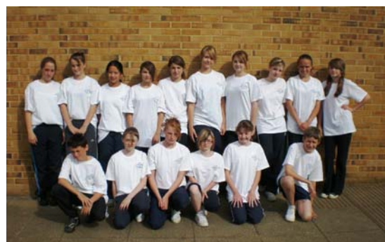
Year 8 Dance Leaders