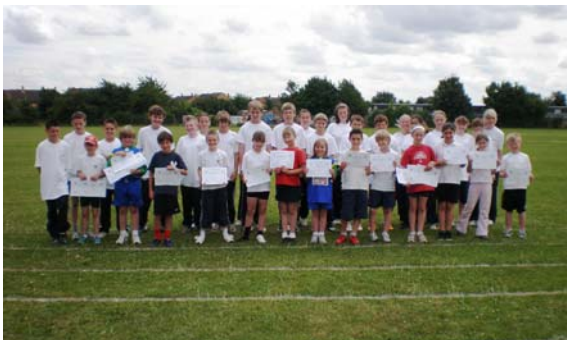
Year 8 Athletics Festival Leaders